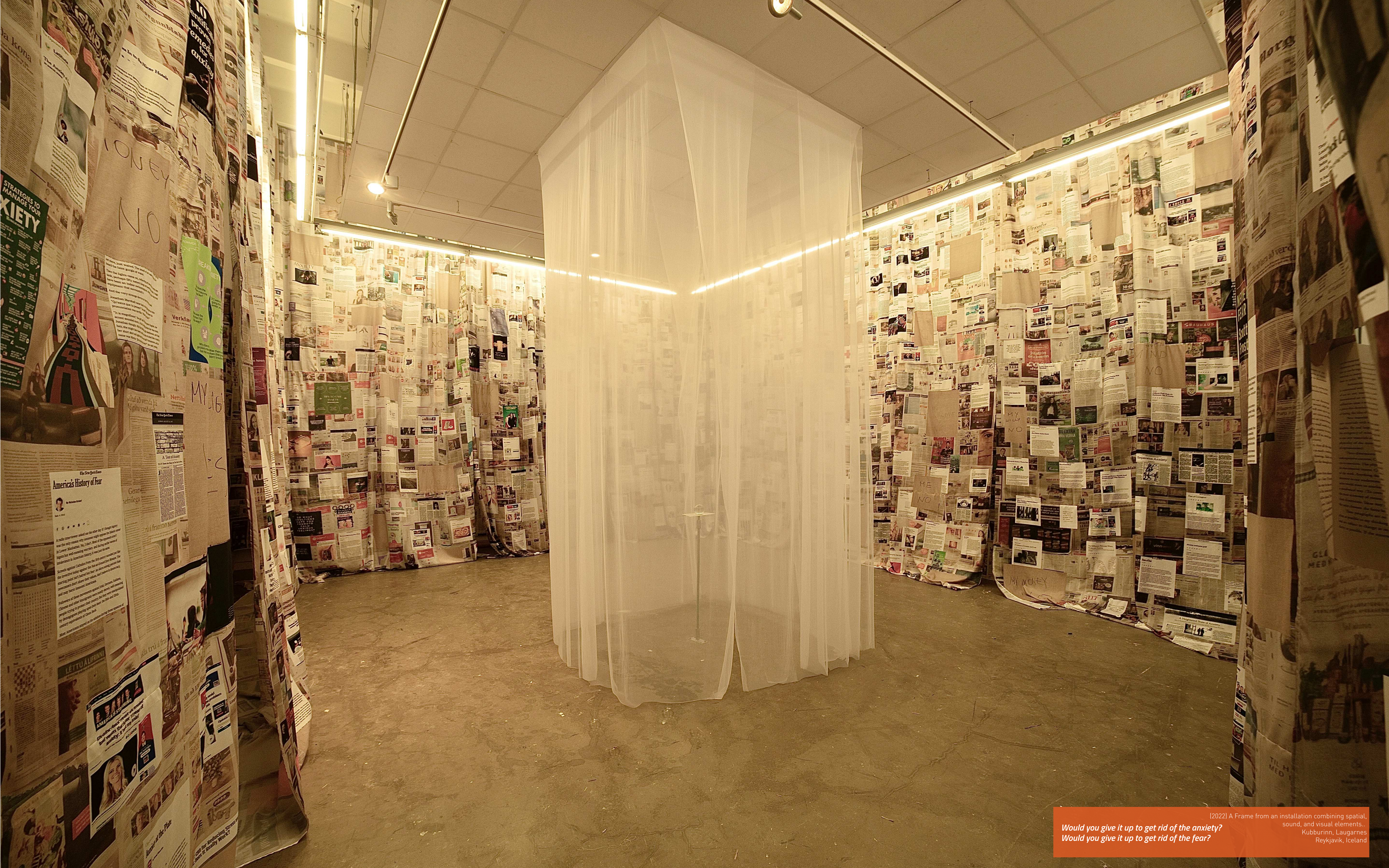
(2022) A Frame from an installation combining spatial, sound, and visual elements.. Kubburinn, Laugarnes Reykjavik, Iceland

Would you give it up to get rid of the anxiety? Would you give it up to get rid of the fear?