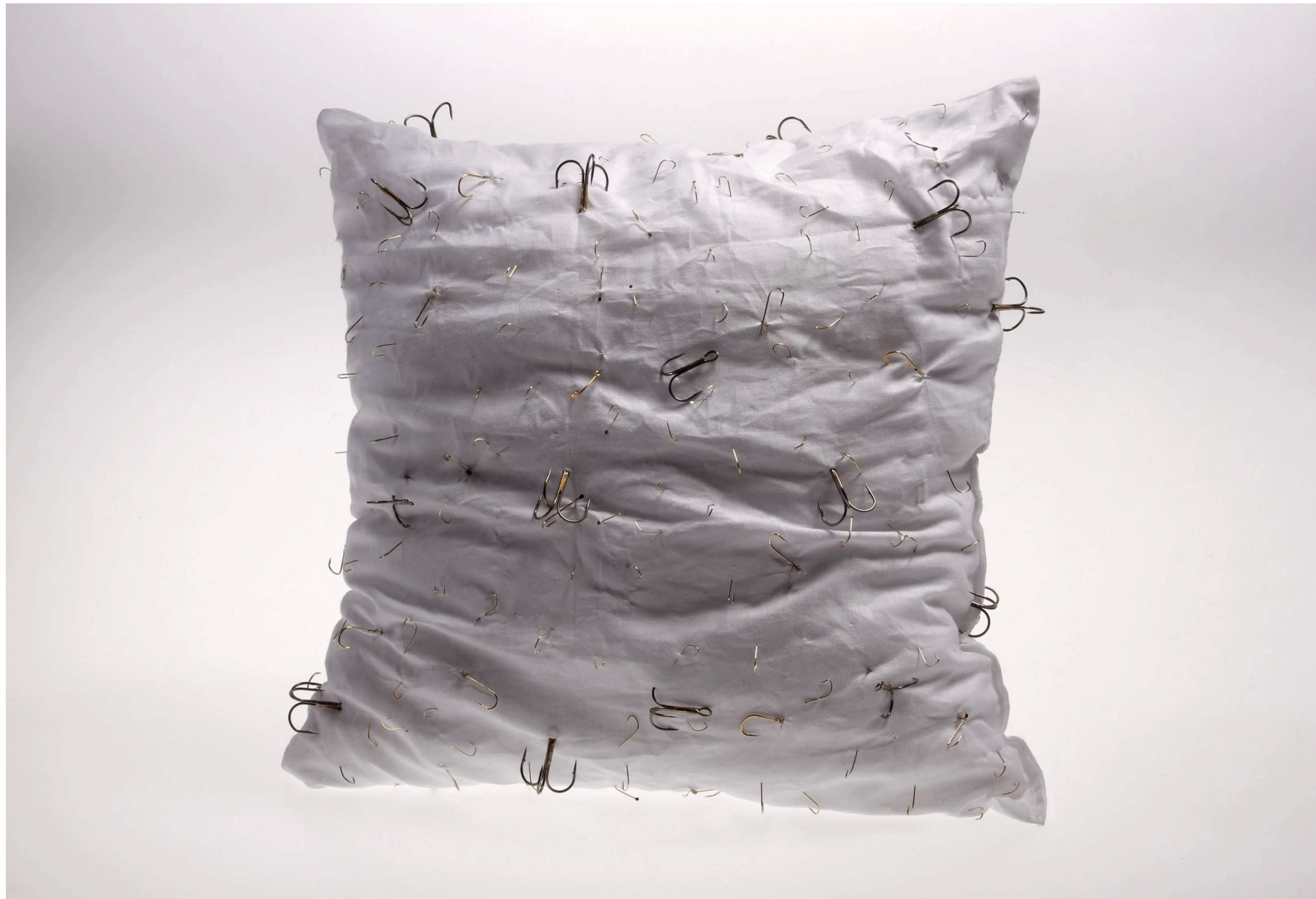
(2018) The Journey Sculpture 40x40cm Academy of Art in Szczecin Poland