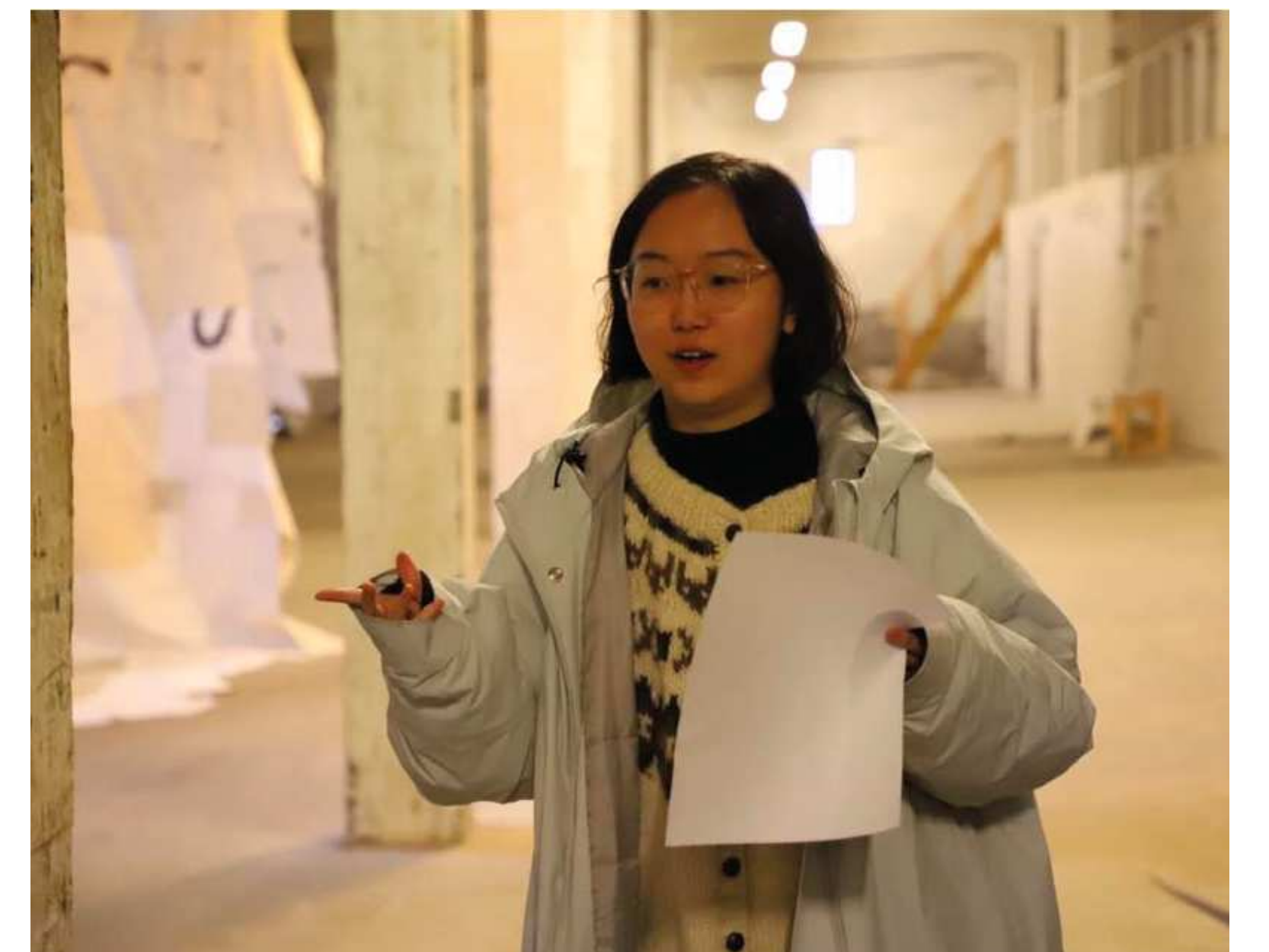
Ég læt ekki spila með mig exhibition (2020) Verksmiðjan Hjalteyri Iceland

This text was read during the exhibition's opening, printed and placed next to the video work (animation of a horizontally spinning branch – screenshot in the previous slide).