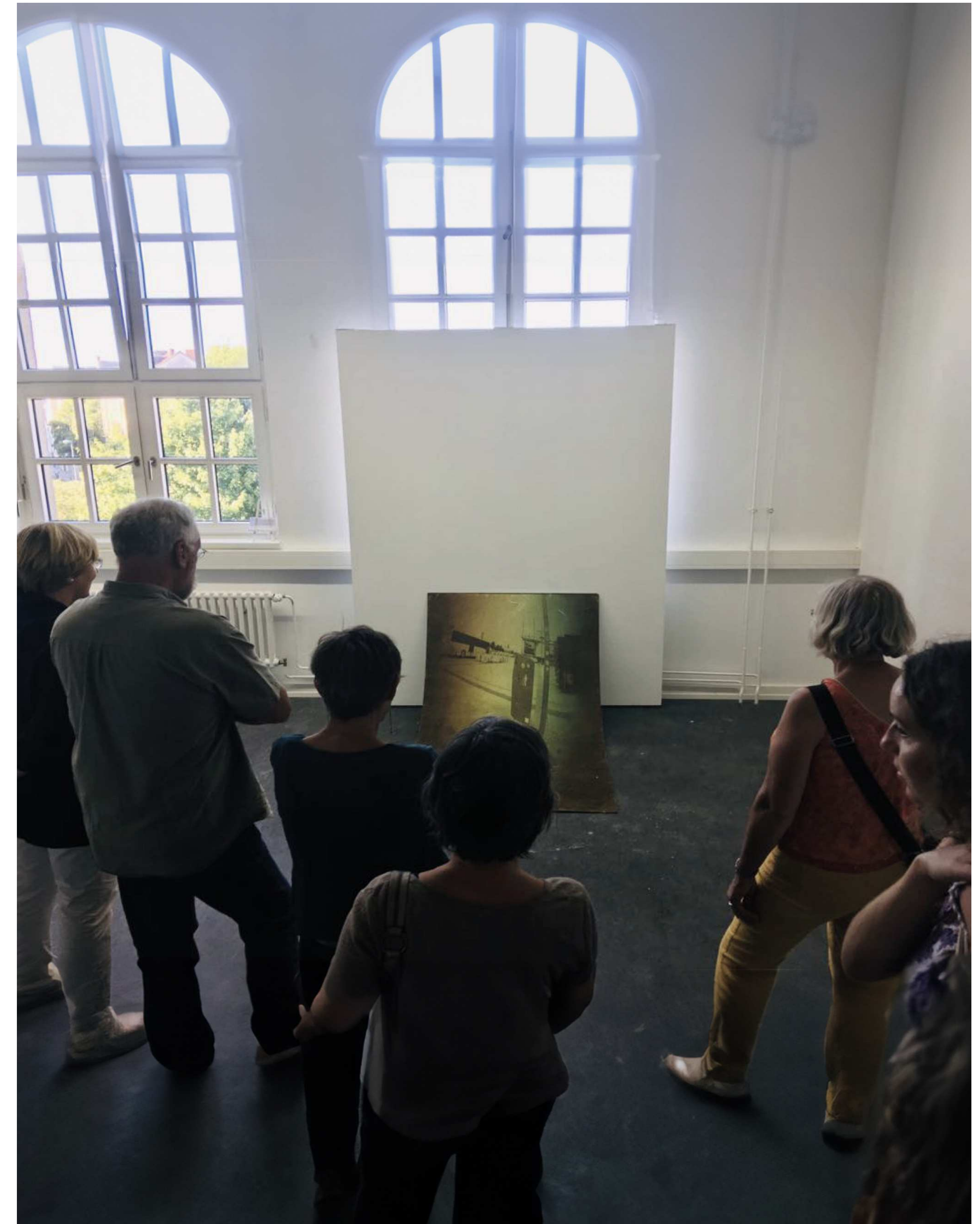
EINBLICK- AUSBLICK exhibition (2018) Muthesius University of Fine Arts Kiel, Germany