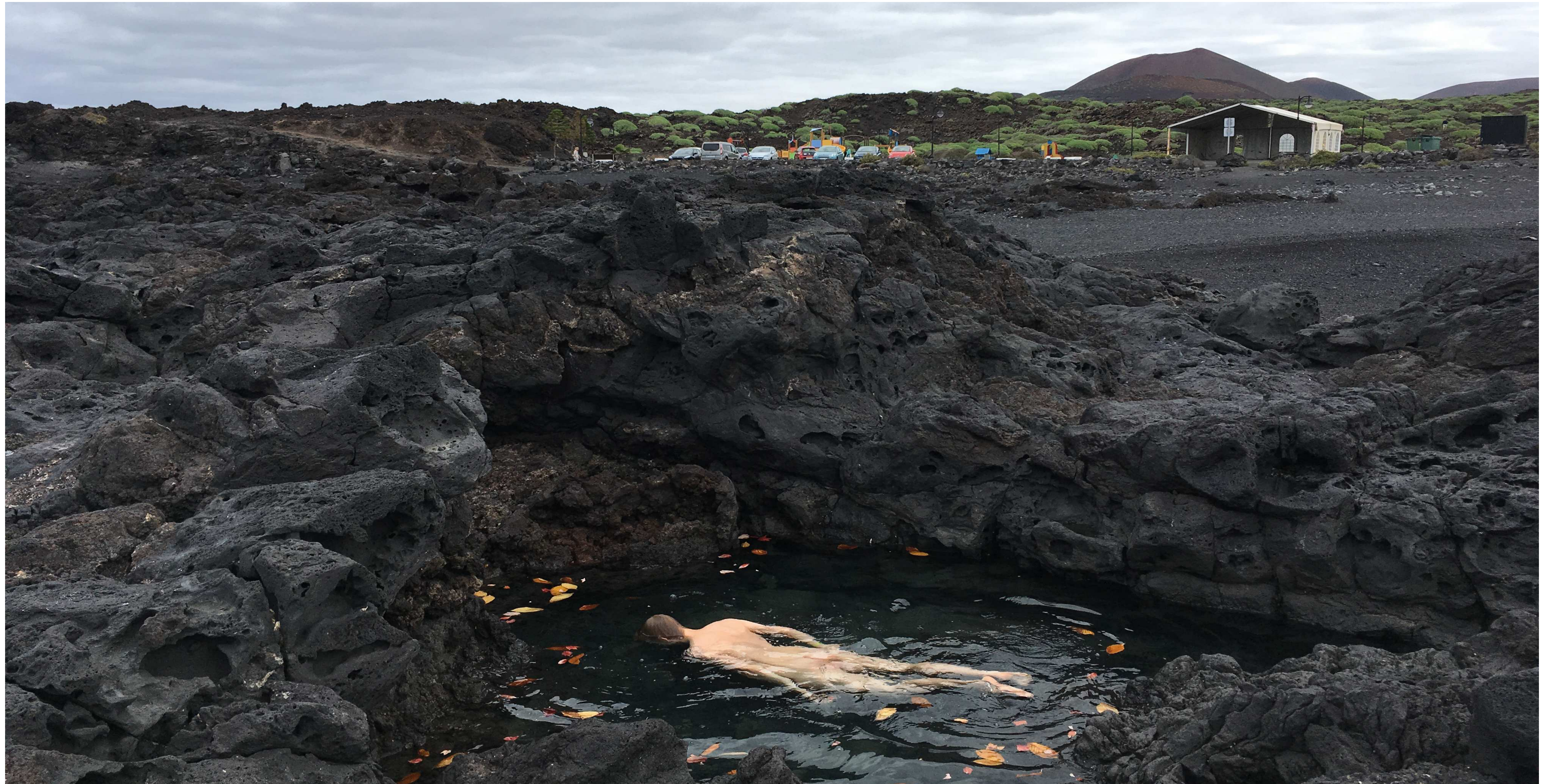
(2018) A Journey to Illusion Photograph Lanzarote, Canary Islands Spain