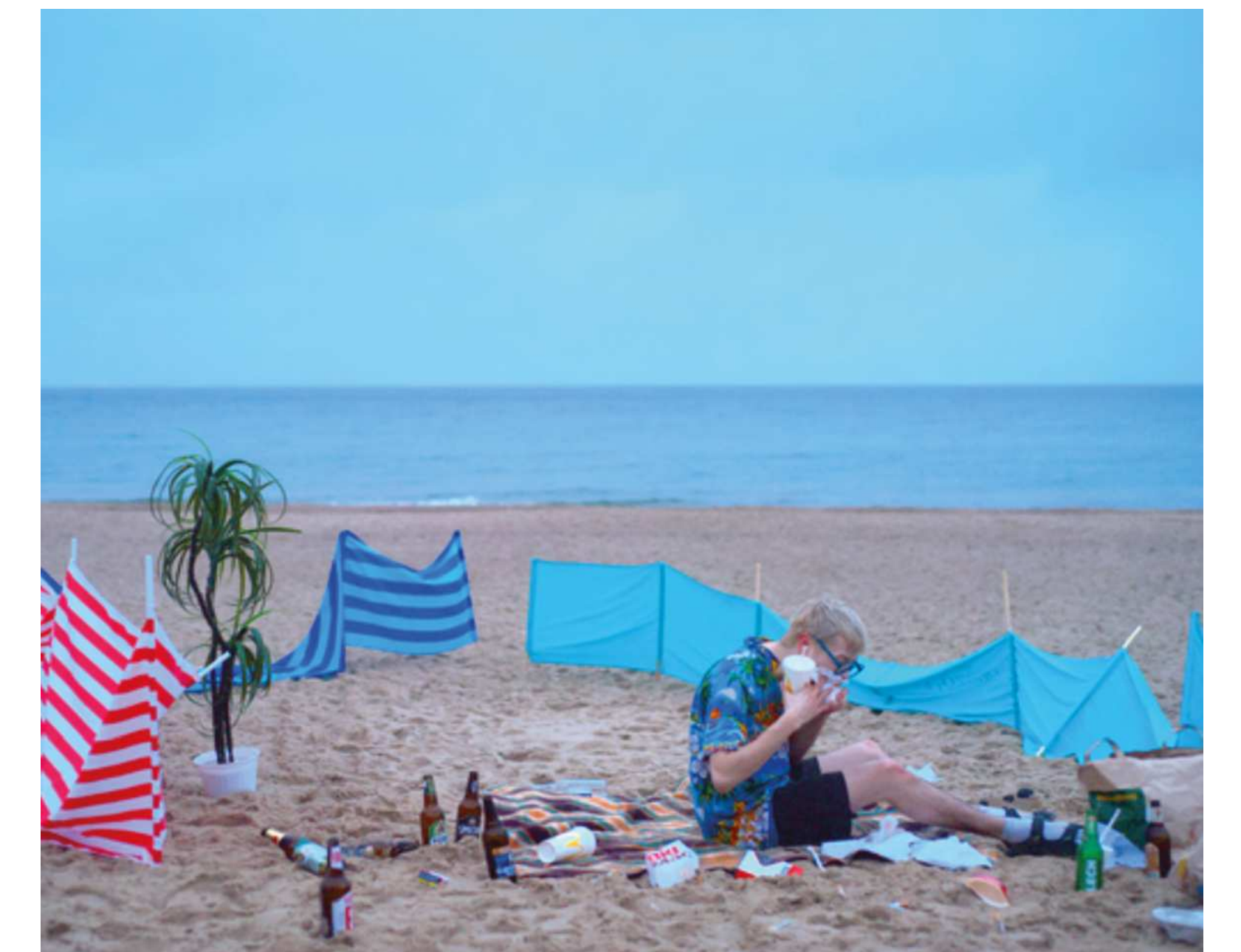
(2019) The Official Opening of the New Season Performative Action - Photo Series Beach in Gdańsk Jelitkowo Poland