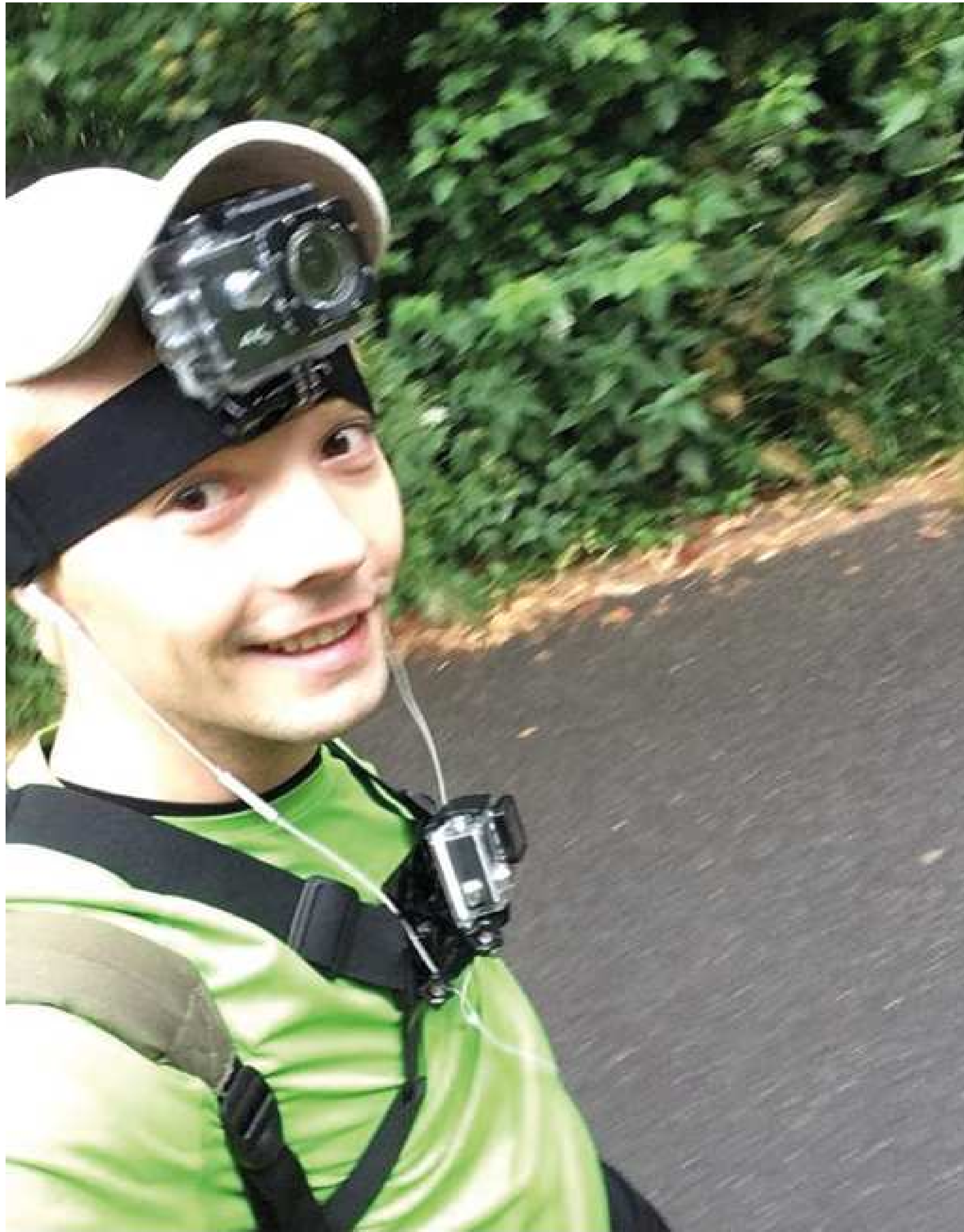
'I sped up 8 hours of full video recording to 23 minutes. Then I projected the video onto a canvas matching the width of the road, covering the surface with bone glue and soil. Here is how I looked during the process.'